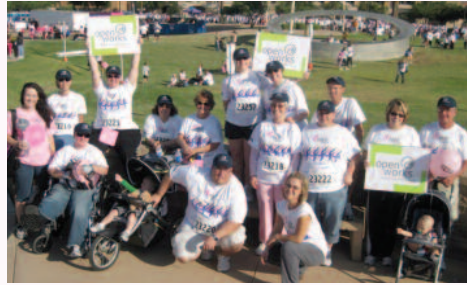
The OpenWorks Team.